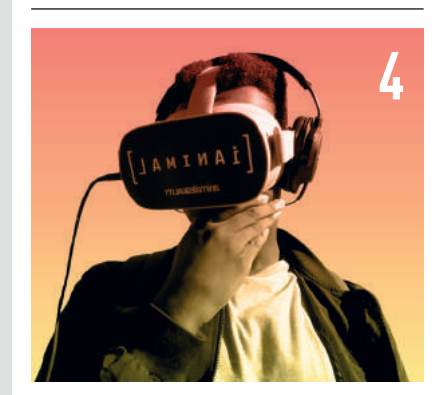
On the road with

Pilgrim's pride Why Pilgrim's Pride shoudn't be so proud