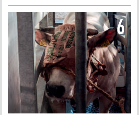
Exposing factory farms worldwide